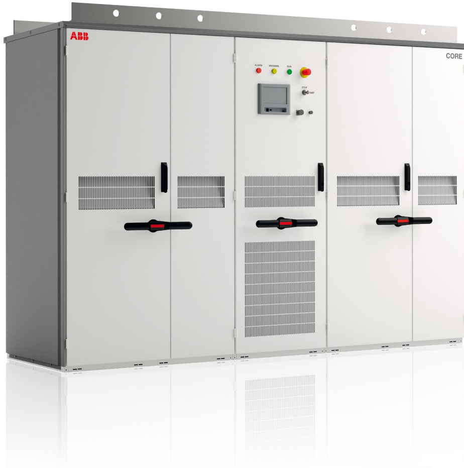
ABB central inverters CORE-500.0/1000.0-TL 500 to 1000 kW

Specifically tailored for the fast growing Chinese market, the CORE-500.0 and 1000.0 incorporate a number of key features including a maximum input voltage of up to 1000 Vdc, enabling high design flexibility and reduced DC distribution losses for large-scale PV applications.